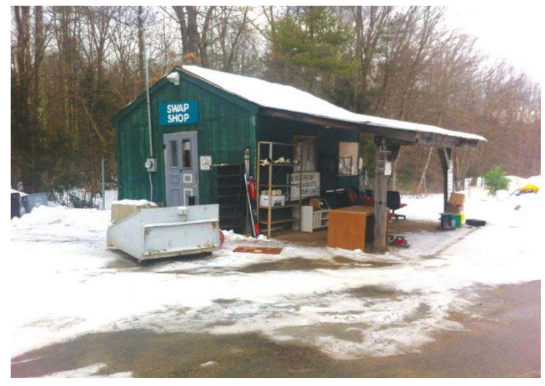
Lee, New Hampshire

A clear declaration that the municipality, town, tribal entity, or other operator does not accept any responsibility for items should also be posted.