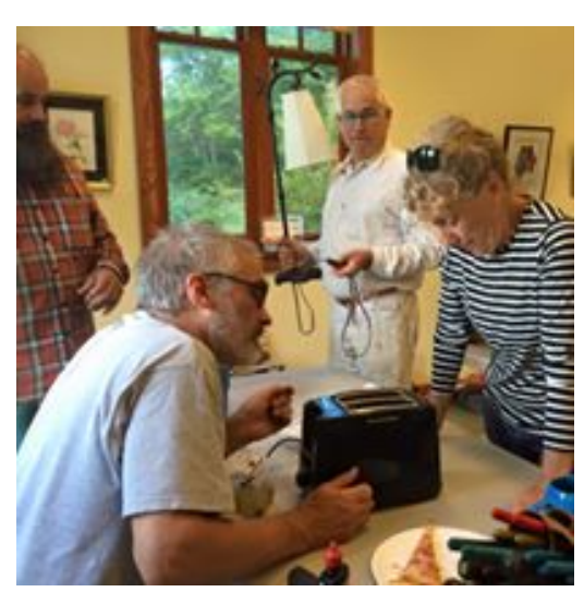
Hudson Valley Repair Café