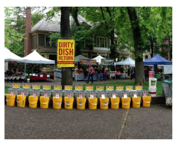
Portland Farmers Market

Ceramic, glass, metal, and durable plastic can be washed and reused over and over again. Durables present a better environmental option compared to disposables. Reusable dishware offers far more in energy and resource savings over its lifetime than its disposable equivalent. Reusables reduce waste and pollution associated with many disposable products. And switching to reusables offers cost savings over the long run. 12