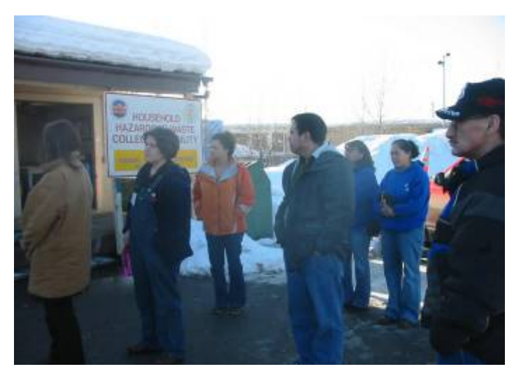
The front of the Anchorage Hazardous Waste Center