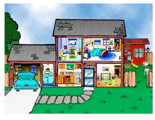
EPA's Virtual Home tour. Click on the house.

Products containing hazardous substances are required by federal law to be properly labeled. Labels on hazardous products use a rating system of four "signal" words. These words are listed below from "most hazardous" to "least hazardous".