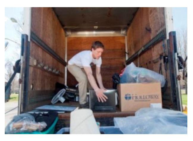
Take it or Leave it Event, Clarkson University

In some "move out" events, organizers work with local nonprofits that accept items for resale or redistribution within the community. At other events, collected items are stored for resale (or as giveaways) to returning students in the fall. Still others do a combination of immediate resale or donation, and storage/resale in the fall.