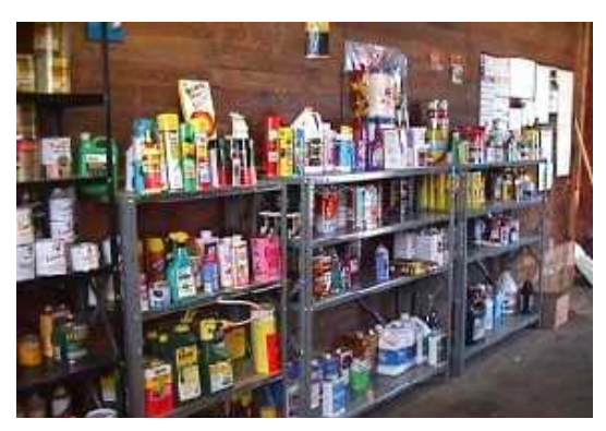
Example of a HHW reuse center

Some communities choose to have reuse/drop-off centers that are open every day. Other communities choose to have monthly or annual drop-off/pick-up days. They plan a big event for everyone to bring their hazardous wastes. Still others might offer a house-to-house collection once per month.