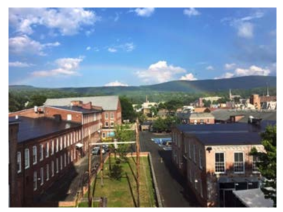
Massachusetts Museum of Contemporary Art