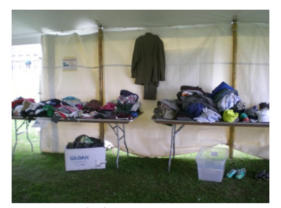
Clarkson University Take it or Leave it Tent

Clean and covered "reuse" bins can be used for temporary centralized storage.