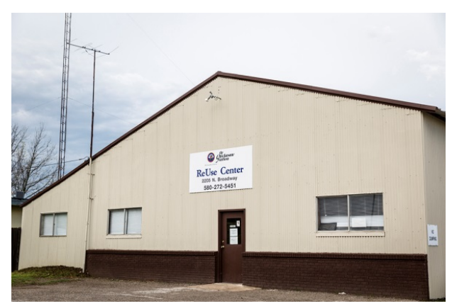
Chickasaw Nation ReUse Center

Thrift stores or secondhand stores sell (and sometimes donate) "as-is" used items. Items range from housewares and clothing to furniture and books. Many thrift stores are operated by charities. Donating items rather than throwing them away can support local charity efforts to sustain job training and self-sufficiency programs for people with disabilities and other life challenges.