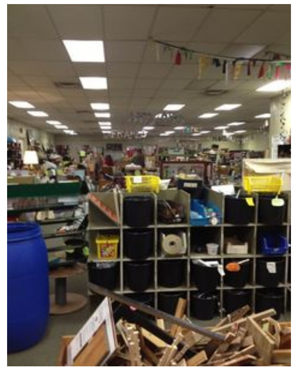
Pittsburgh Center for Creative Reuse